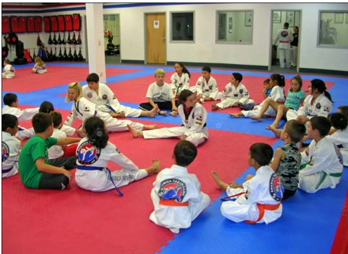
ATC students bring relatives and friends on "Buddy Day." A great way for new students to become part of the ATC family!

From now through the month of March 2009! Calling all ATC parents and students! Sign-up a family member, friend, or colleague for a one-year ATC contract and you'll receive a free month of tuition!